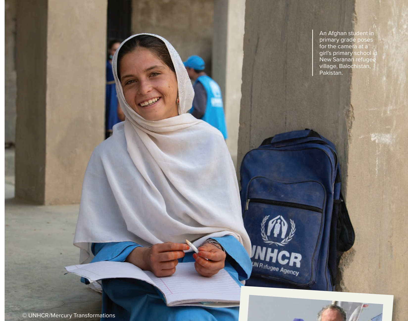
An Afghan student in primary grade poses for the camera at a girl's primary school in New Saranan refugee village, Balochistan, Pakistan.